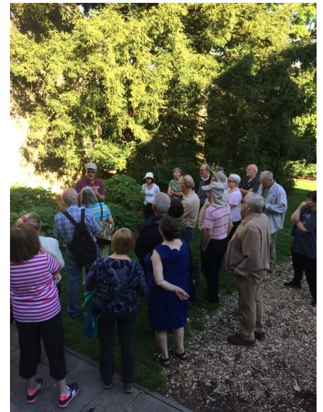
Introductions at Scott Arboretum tree peony tour, light refreshments, and touring the grounds of Swarthmore College