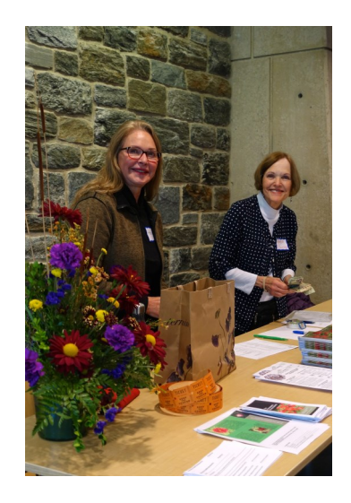
MAPS Greeters on October 14 registering everyone.